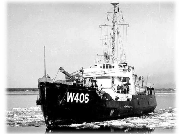
USCGC ACACIA WLB-406