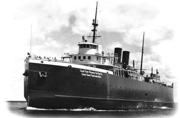
S.S. CITY OF MILWAUKEE

Join Us in preserving these GREAT LAKES LEGACIES